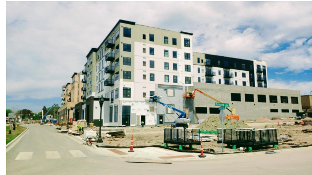
Construction in progress at Highland Bridge