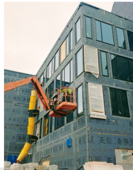
Current progress shot