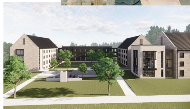
End result goal