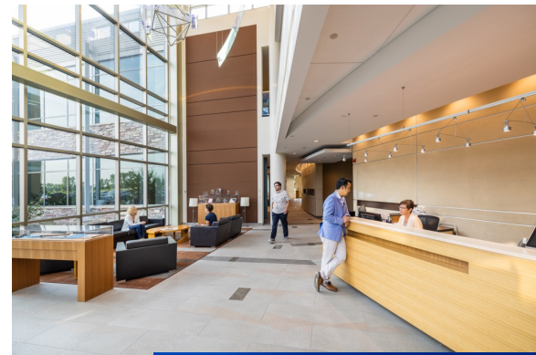
Blattner Company corporate office expansion