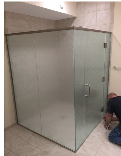
Right: One of the 24 shower enclosures after installation